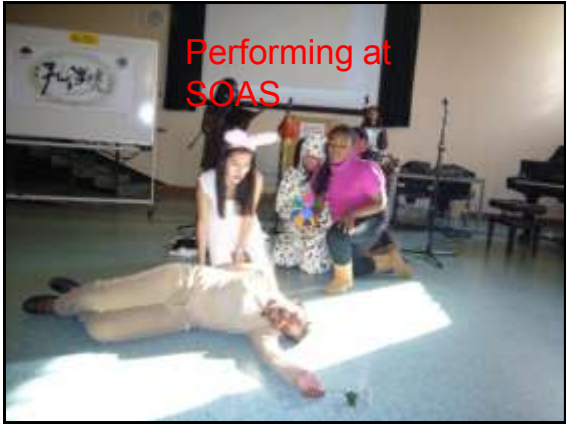
Performing at SOAS