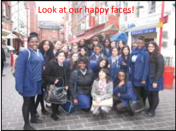
Look at our happy faces!