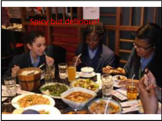
Spicy but delicious!