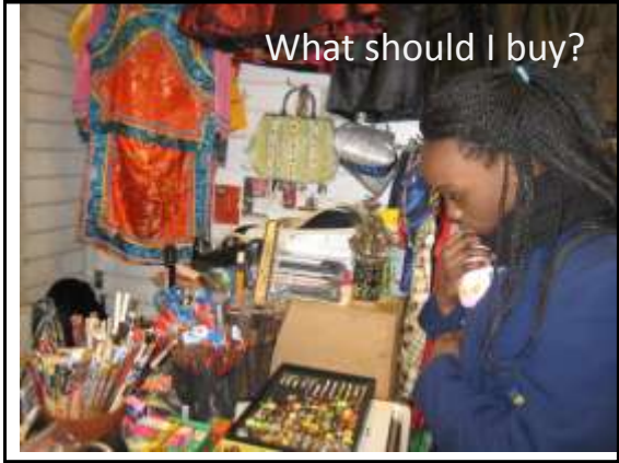
What should I buy?